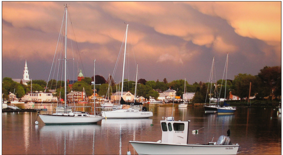
of Barrington harbor.

BARRINGTON YACHT CLUB | Saturday, September 27, 5 – 8 PM