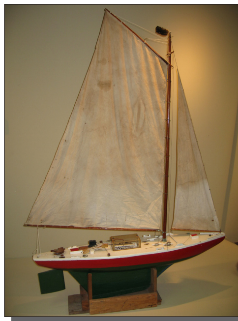
Pete Waterman's pond boat from the 1930's

The exhibit will remain open while a permanent exhibit of the important periods in Barrington history is installed. level of the Peck Library Building, and the exhibit will run through November 1.