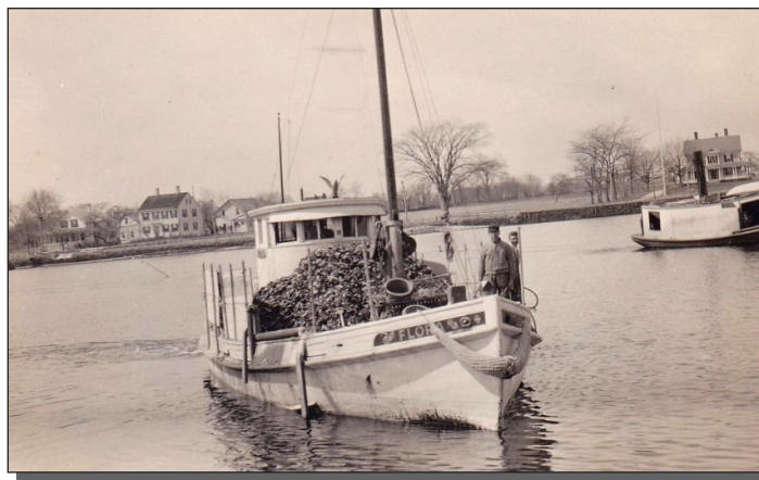
Testing the waters in early spring 1912